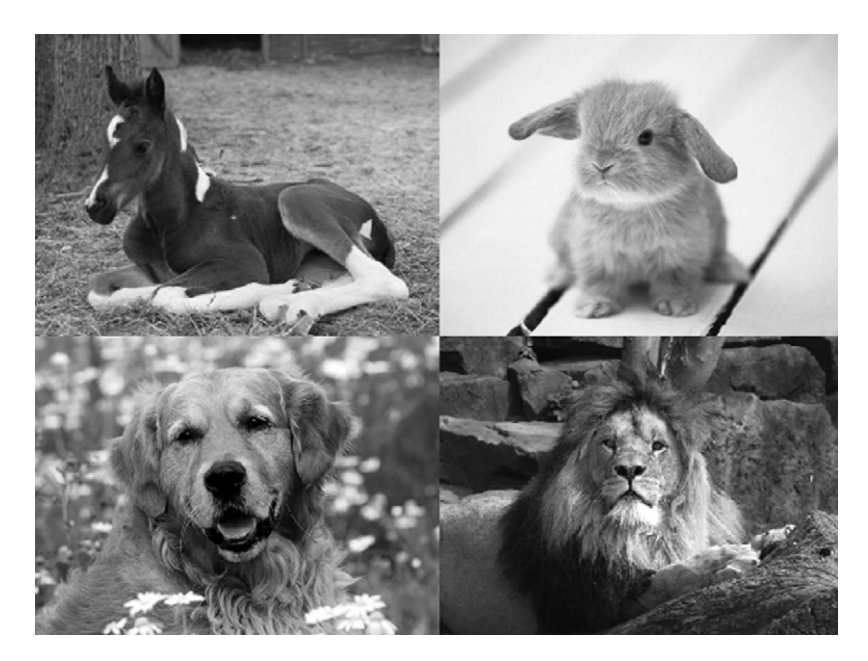
Fig. 1. Examples of the juvenile and adult animal pictures used in all three studies.