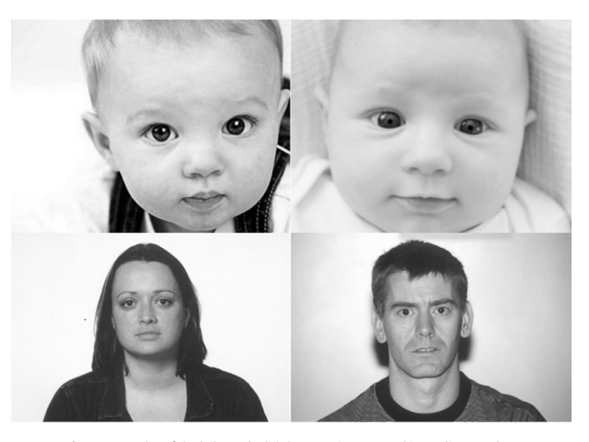
Fig. 2. Examples of the baby and adult human pictures used in studies II and III.

Descriptive statistics for all variables of this study are presented in Table 1. Similar as observed in study I, men and women did not differ in their reported attachment styles, whereas their empathy scores differed significantly, with women scoring higher on both subscales of the BES and on the total score. The average difference was higher for affective than for cognitive empathy. The human baby pictures were significantly rated more positively than the human adult pictures (t = 40.68, p < .001) and the same pattern was found for the animal pictures (t = 19.53, p < .001). Hence, the difference scores were also consistently positive. Correlational analyses showed that the ratings of the human babies and infant animals were moderately associated (r=.54; p<.0001), while the human and animal difference scores were only weakly associated with r = .20 (p < .0001). Gender emerged as a predictor in every multiple regression analysis indicating that women rated all pictures more positively than men. Affective empathy also turned out to be a significant predictor in these regression analyses (except in case